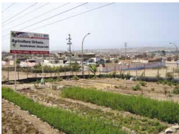
Community gardens in Lima