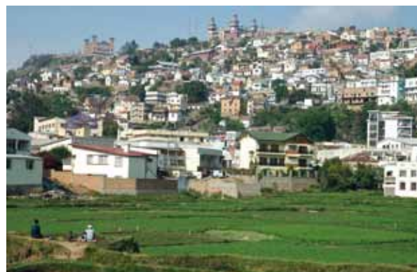
UPA produces food close to the city, hence less energy use

If food prices increase due to damaged infrastructure or a decline in agricultural productivity, this directly effects the urban poor who can save only on the number of meals and food quality (since rent, electricity and water have to be paid anyway), leading to a decline in nutrition and health status (Prain, 2010).