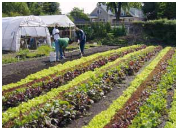
UPA enhances community building (here in Chicago)