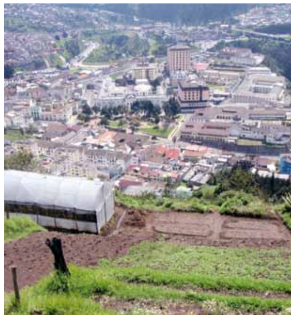
UPA can reduce the impacts of higher rainfall

Urban agriculture is one of these “outside-the-box” solutions currently being considered, as urban agriculture can play a strong role in enhancing food security for the urban poor, greening the city and improving the urban climate, while stimulating the productive reuse of urban organic wastes and reducing the urban energy footprint.