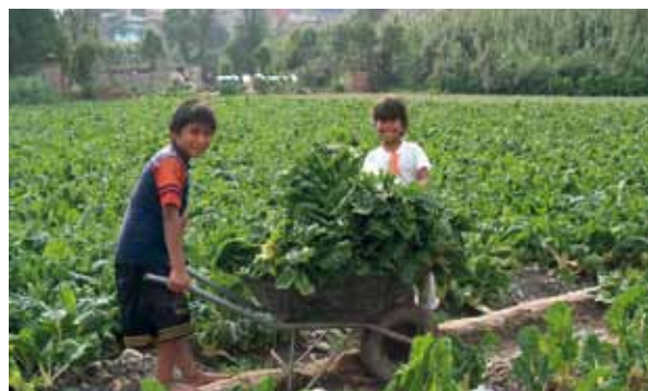
UPA enhances access to nutritious food