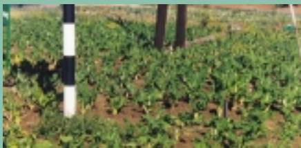
Small-scale subsistence crop of spinach and sukuma wiki in a roundabout near Kibera (Southwest Nairobi, low income area).