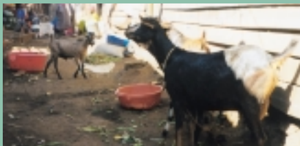
Small-scale livestock production: goats in Kariobangi (Northeast Nairobi, low income area). The fodder (usually urban waste) is brought to the animals, that spend the night under one roof with the owner until ready for sale.