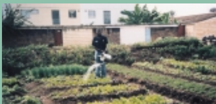
Small-scale market-oriented crop cultivation: vegetable seedlings for sale (Northeast Nairobi, middle-income area). The plot belongs to a self-help group of young men from neighbouring Mathare (low-income area).