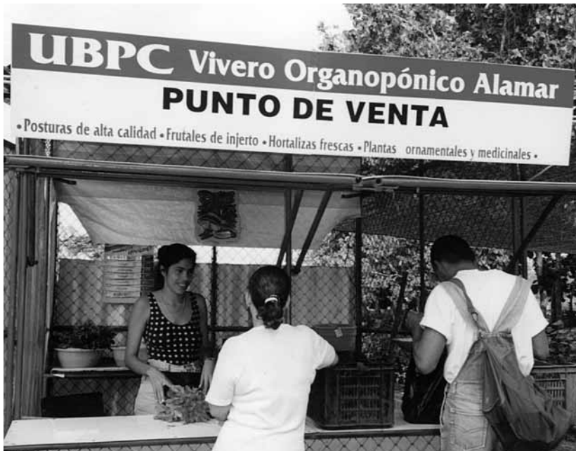
Urban agriculture: public sales outlet, Havana.