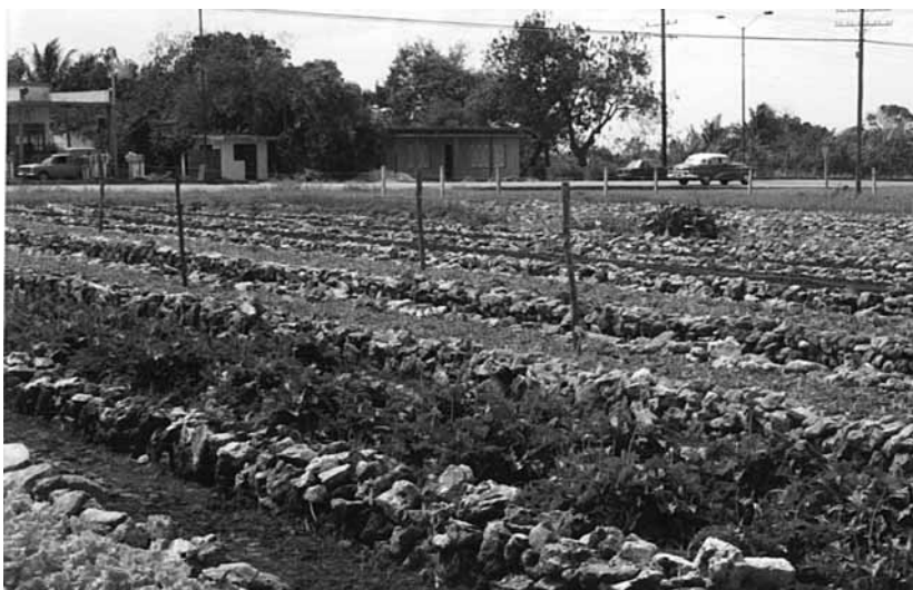
Organoponic intensive farming at the "Gilberto León" Cooperative.

The heterogeneity of Cuba and the diversity of possible ways to grow vegetables have combined to generate distinct production systems. The most common are the following: