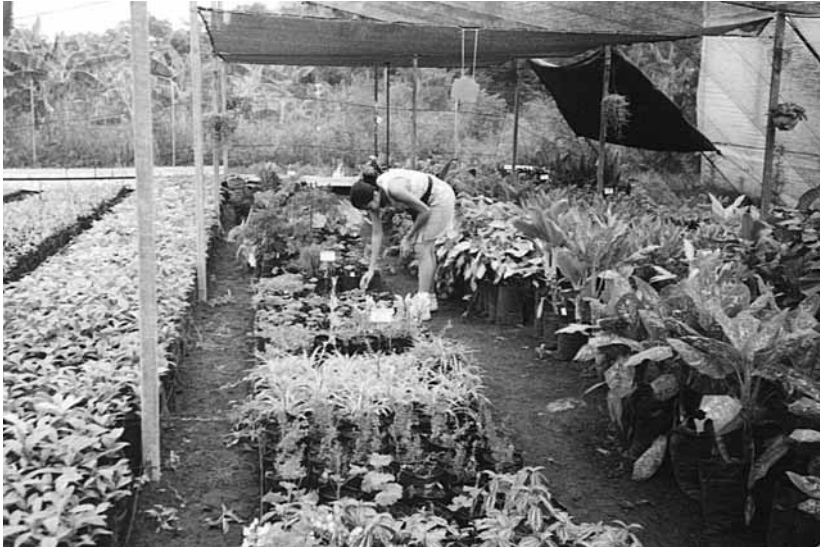
Ornamental plant nursery at the Alamar UBPC in Havana.