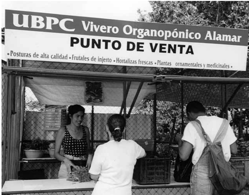
Urban agriculture: public sales outlet, Havana.

services, and/or inputs. This new agricultural labor force has brought dynamism and innovation to every municipality.